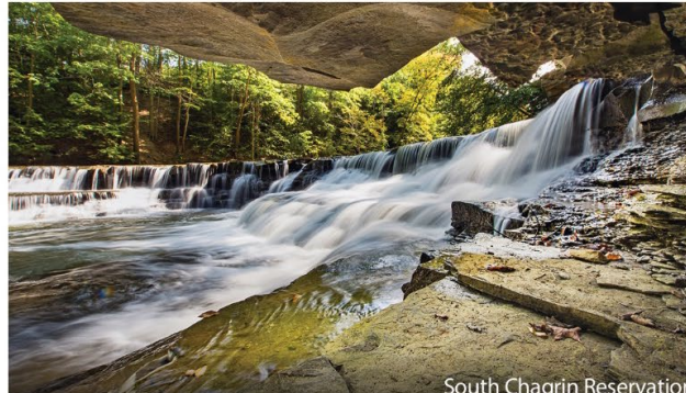
South Chagrin Reservation

Four in-person meetings had an average of 50 attendees. 38 people registered for the online option.