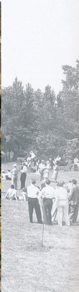
Music Mound Mill Stream Run Reservation