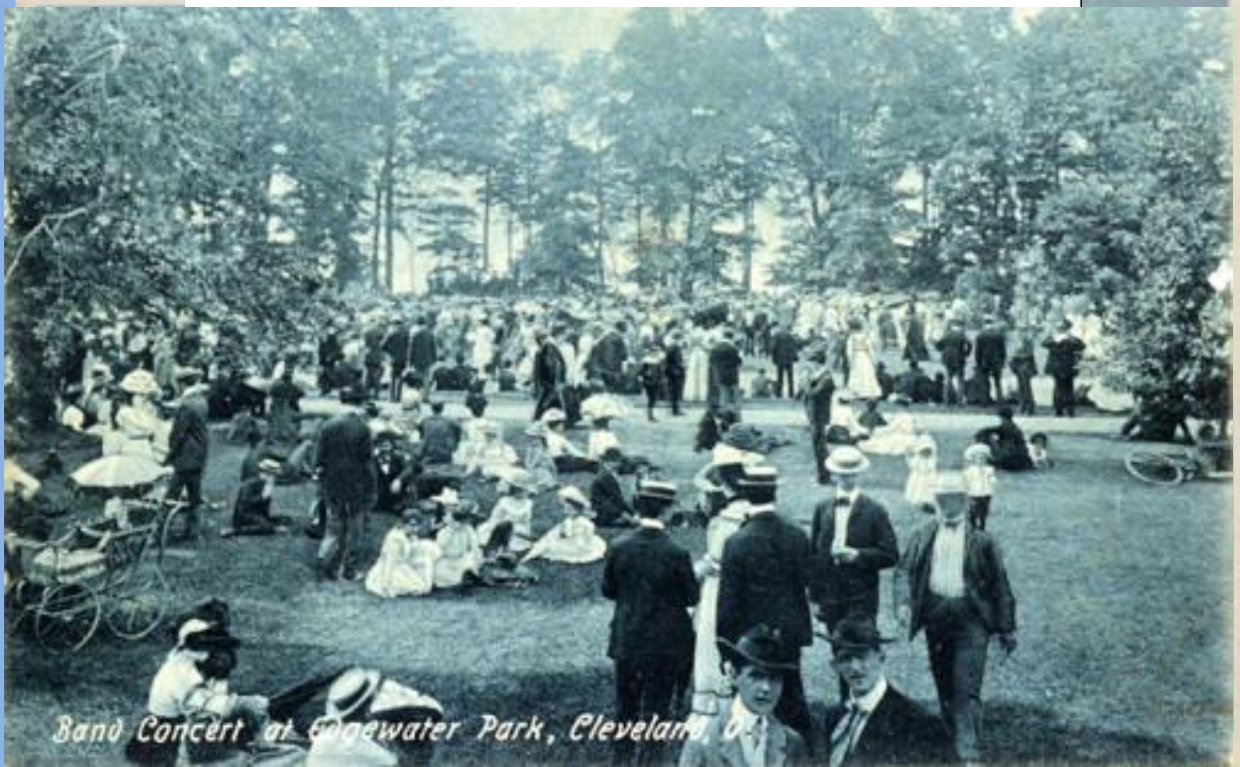
Band Concert at Edgewater Park, Cleveland, O.